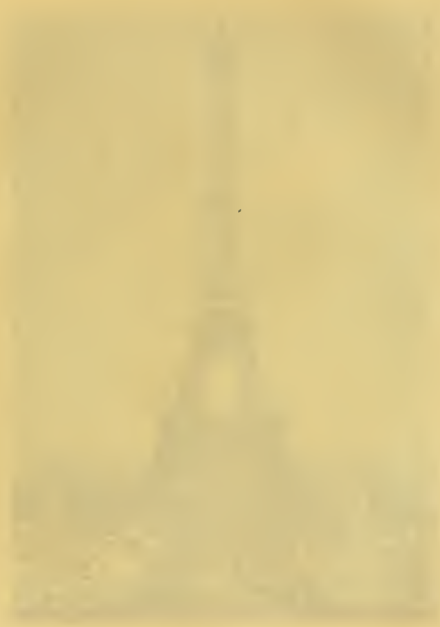
The Eiffel Tower Paris