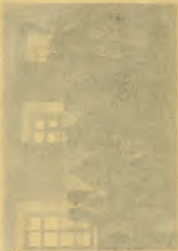
Photograph from Photograph by A. B. Brown in an Evening-house